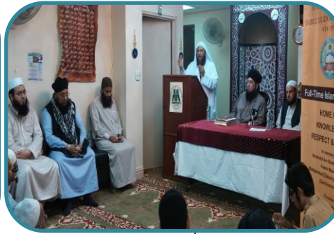
August 23 rd , 2014