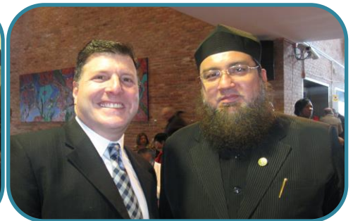
Meeting officials of New York Assembly