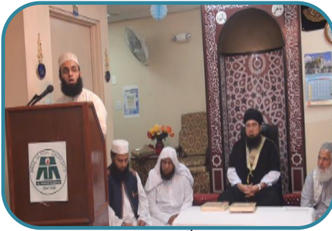
September 15 th , 2012