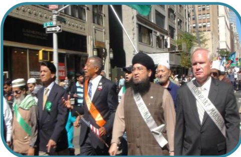
Grand Marshal at Muslim Day Parade