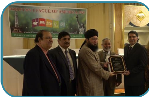
Awarded Alama Iqbal Award