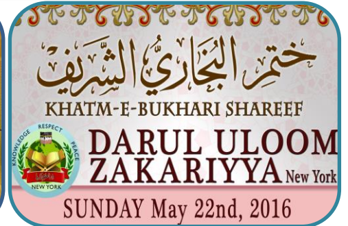
May 22 nd , 2016