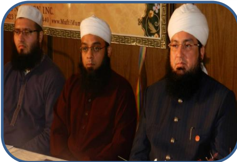
June 23 rd , 2013