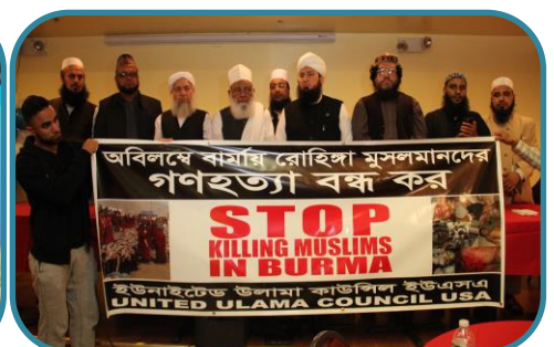
Protesting against injustice