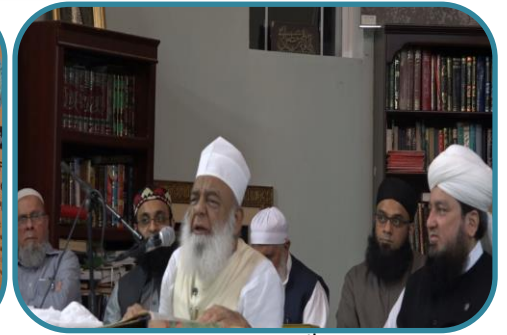
September 4 th , 2015