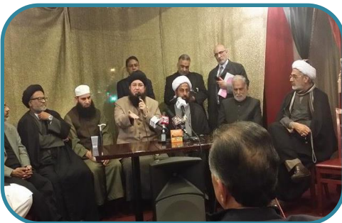
Taking the lead in addressing social and political issues to create unity and harmony among cross sections of the society.