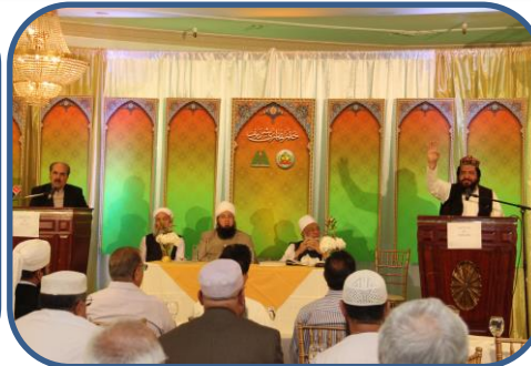
June 7 th , 2015